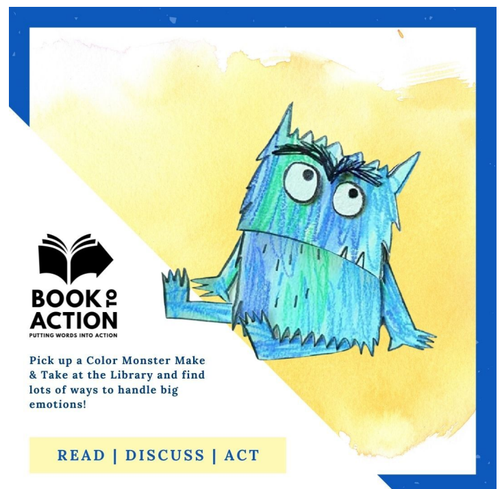
Image 2 Caption: Lincoln Public Library Book to Action 2021 Color Monster Social Media Ad

California Center for the Book is a program of the California Library Association , supported in whole or in part by the U.S. Institute of Museum and Library Services under the provisions of the Library Services and Technology Act, administered in California by the State Librarian .